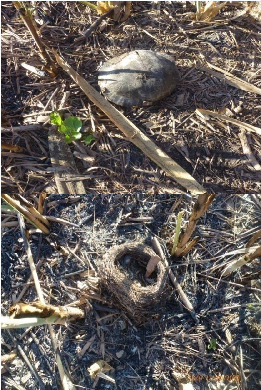
Figure 8. Carcass of a turtle and a bird's nest impacted by the fires in the Middle Oum Er Rbia River, south west of the village of Lamrabta (site 3, Fig. 1) (February 2020).