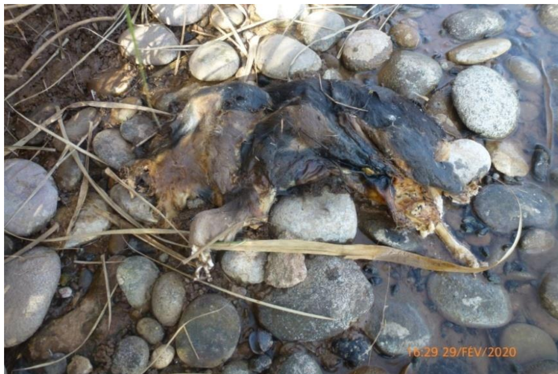
Figure 5. A cadaver of Lutra lutra found in the south west of the village of Lamrabta (site 3, Fig. 1) (February 2020).

In this study, we were unable to photograph otters in the study region. Otters are quite difficult to see in the wild. In the study region, they are very discreet and they flee from humans because inhabitants throw stones at them. These mammals are principally nocturnal or crepuscular and they spend a lot of time in the water. In addition, the study region is frequented by fishermen and other inhabitants overnight. For this reason we were not allowed to install the camera during the time required to collect additional data. Several researchers were unable to photograph otters, although they installed cameras for months. For example, at Sungai Relau and Sungai Ceruai, seven months of continuous camera trapping, riverbank surveys and observations resulted in no Hairy-nosed Otter records (Fernandez, 2018).