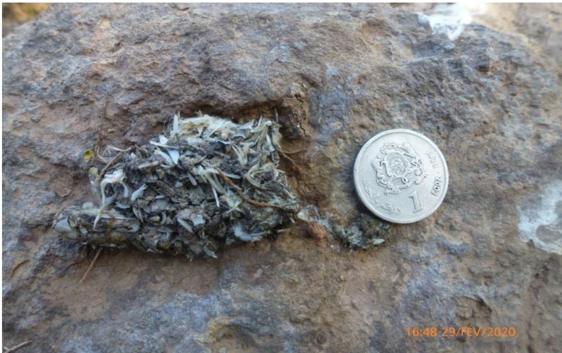
Figure 4. Scats of Lutra lutra found in the south west of the village of Lamrabta (site 3, Fig. 1). (February 2020).