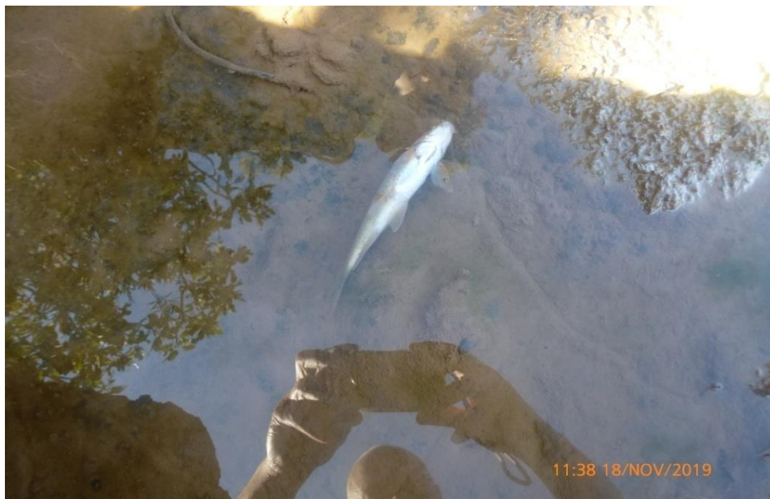
Figure 7. Dead fish floating in the Middle Oum Er Rbia River, west of the village of Sidi Aissa Ben Ali (site 2, Fig. 1)