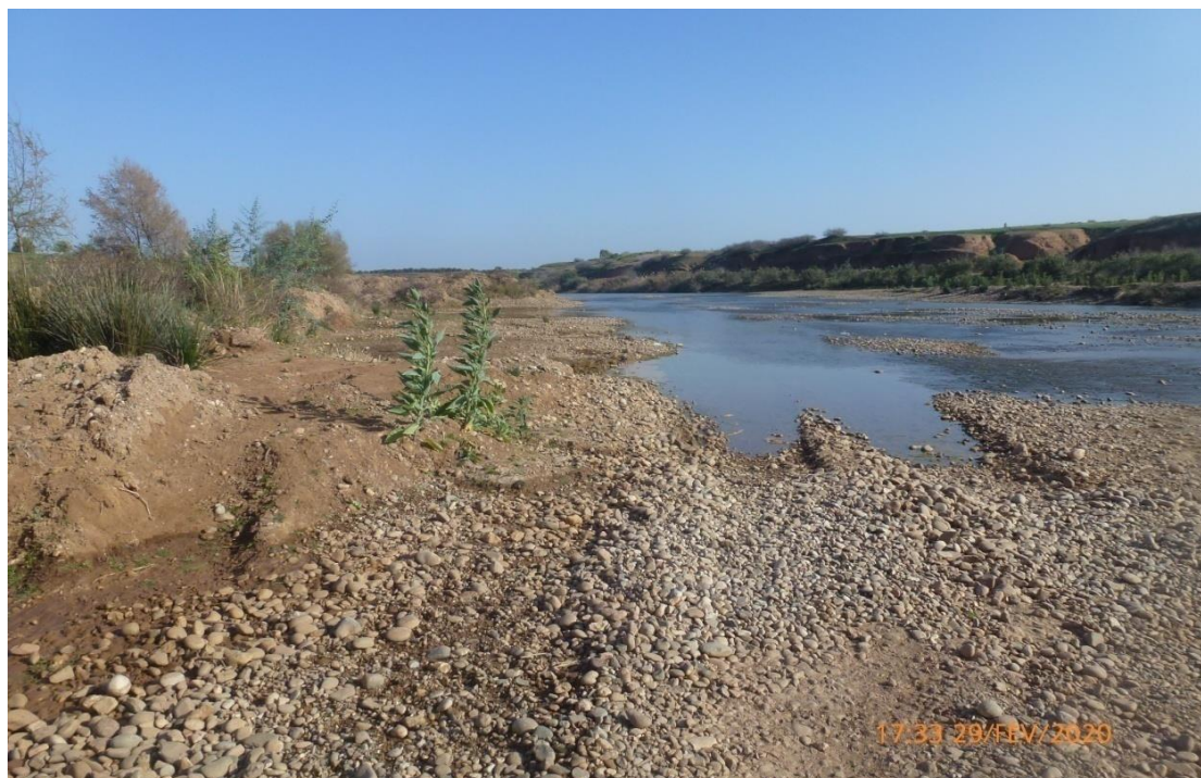
Figure 6. Picture showing the destruction of Lutra lutra habitat in the Middle Oum Er Rbia River at Lemrabta region.