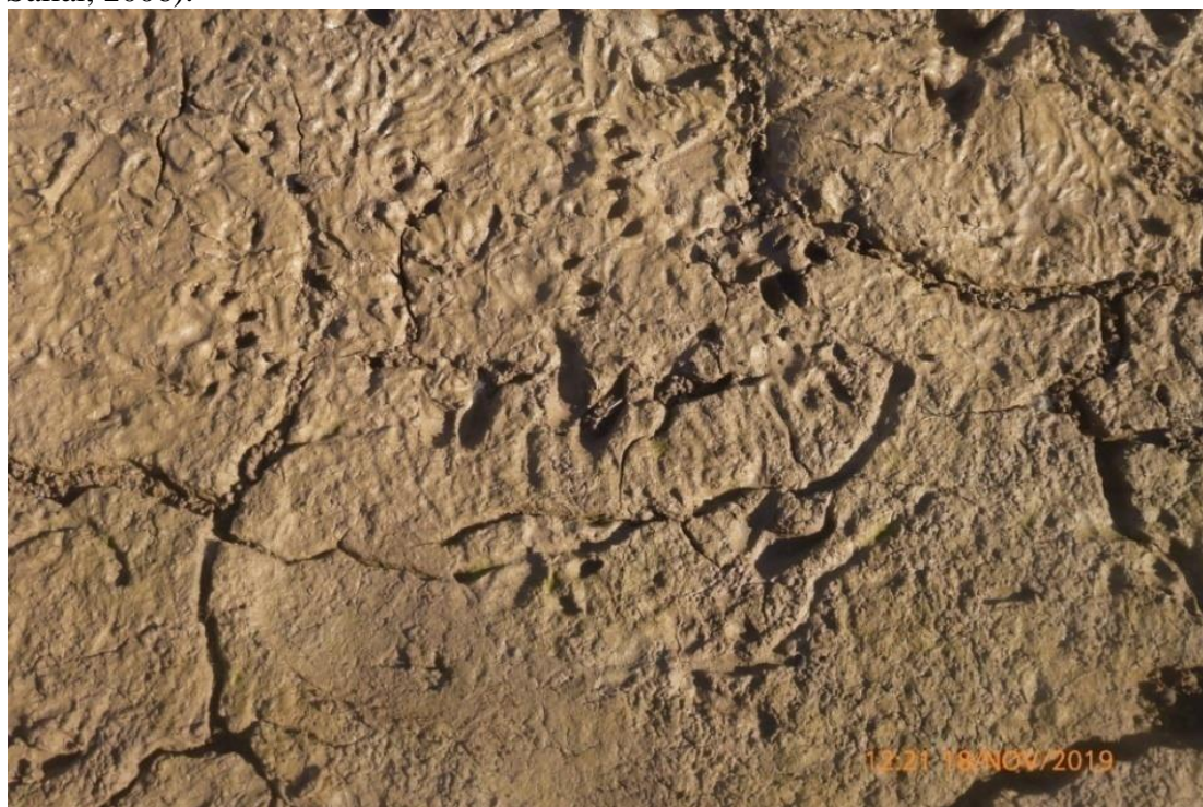
Figure 2. Footprints of Lutra lutra found in the Middle Oum Er Rbia River, west of the village of Sidi Aissa Ben Ali (site 2, Fig. 1) (November 2019).

Results of the surveys confirmed the presence of Lutra lutra in two sites: in 'La Chutte' (site 2, Fig.1) and in the south west of the village of Lamrabta (Site3, Fig. 1). In Ouled Jbir (site 1, Fig. 1), although 11 local inhabitants confirmed the observation of an otter's cadaver near this village in 2019, we did not find any sign of the actual presence of otters. In the sites 2 and 3, we found spraints (Fig. 2, Fig. 3) and footprints of otters (Fig. 4). According to inhabitants who frequent the river at night, at least 7 otters were observed in site 2, and 5 otters in site 3. In the south west of the village of Lamrabta (site 3, Fig. 1), we found cadavers of two juvenile otters (Fig. 5). Results of the interviews showed that the two dead otters were not killed by inhabitants. The majority of the interviewees who frequent permanently the river confirmed that they find cadavers of dead otters in the river during the last two years. Observation of the scats found showed the presence of scales and fish bones with a dominance of the shells of freshwater gastropods, namely the subclass of Prosobranchs and other taxa of Gastropods. The presence of these preys in the otter's diet has been already confirmed by several studies (Mason and Macdonald, 1986, 1993; Lanszki and Kormendi, 1996; Kingston et al., 1999; Lanszki and Molnar, 2003; Lanszki and Sallai, 2006).