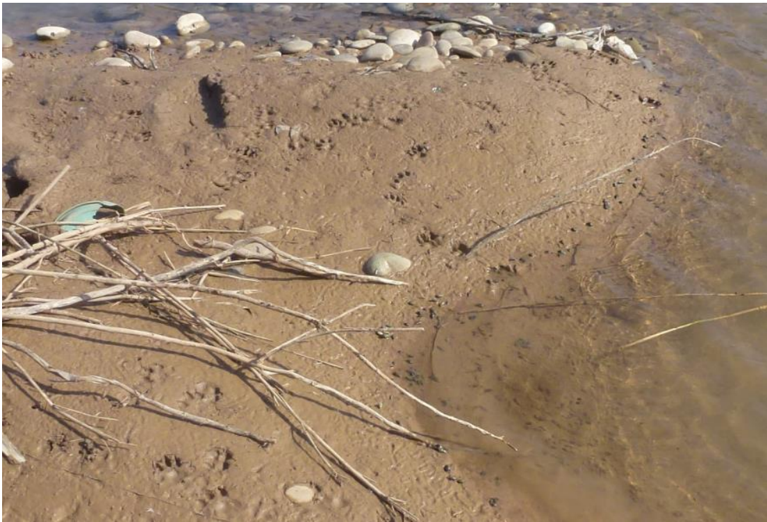
Figure 3. Footprints of Lutra lutra found in the south west of the village of Lamrabta (site 3, Fig. 1) (February 2020).