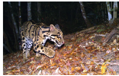
ເຈື່ອນໄຫວລຳ ເຈື່ອນໄຫວລຳ (Neofelis nebulosa)

Altogether NEPL NP hosts 19 carnivore species, roughly 50 species of mammals, and 299 species of birds, including, Blyth's kingfisher, Spot-breasted Laughingthrush, Rufous - Necked Hornbill, Red-Collared Woodpecker, Indochinese Green Magpie.