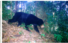
ເສຍຢາຍ ເສຍຢາຍ (Helarctos malayanus)