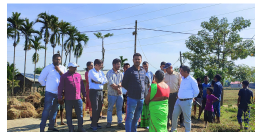
Exposure visit of the delegation from Government of Bihar (DoF, Bihar, JEEViKA and MGNREGS) in Assam