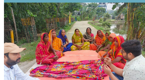
Interaction with the members of a producer group in Araria, Bihar