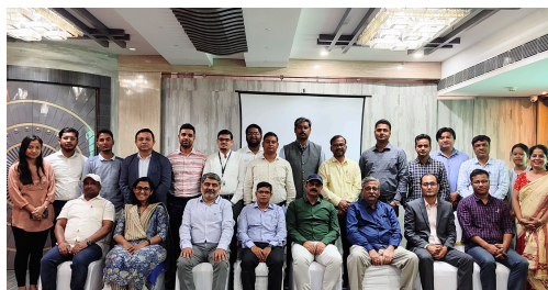
Joint session on sustainable aquaculture among GIZ and government officials from Assam and Bihar