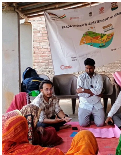
CRPs being trained in villages by resource person in Araria, Bihar

Contextualisation of knowledge products and Information, Education and Communication (IEC) materials for easy adoption