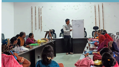
Resource Person providing CRP training to fish farmers in Araria, Bihar