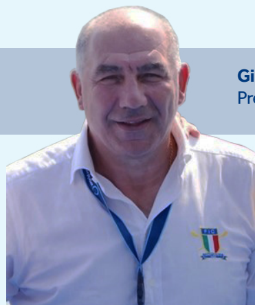
Giuseppe Abbagnale President Italian Rowing Federation (FIC)

We're proud to be pioneering a project for the World Rowing & WWF Healthy Waters Alliance. Bringing together FIC and WWF Italy to engage the Rowing community to protect and restore Italian Beaches. Italian Rowing clubs will be able to engage with the Adopt a Beach Programme, to empower their Rowers, coaches and volunteers to take an active role in cleaning up their beaches, protecting where we row and our planet.