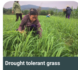
Drought tolerant grass

Son Tien & Son Hong communes, Huong Son district Dong Loc commune, Can Loc district Phuc Dong & Loc Yen communes, Huong Khe district Ky Tay commune, Ky Anh district