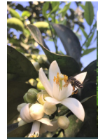
Fruit tree-based agroforestry, Apiculture in agroforest & forest system

Son Tien & Son Hong communes, Huong Son district Dong Loc commune, Can Loc district Phuc Dong & Loc Yen communes, Huong Khe district Ky Tay commune, Ky Anh district