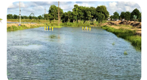
Giant freshwater prawn - fish rotation with agroforestry