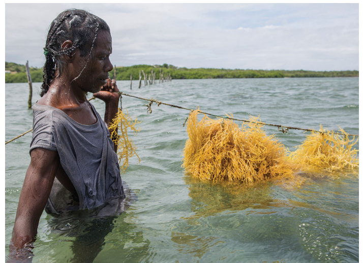
TOP The Nature Conservancy scientists and staff train a group of young coral gardeners from Grenada to plant staghorn corals grown in nurseries onto damaged reefs. BOTTOM A community member in Saint Lucia shows off a sea moss farm. Farmed sea moss is an environmentally sustainable source of income for coastal communities.

To help improve the enabling conditions of its partners and grantees, the CBF plays several roles. The CBF 1) convenes meetings of diverse stakeholder groups to advance dialogue on common issues; 2) builds the capacity of partner national funds, their grantees and host governments; 3) raises awareness at the regional and international level of the importance of conserving the Caribbean's natural resources for a sustainable future; and 4) serves as a forum for regional coordination and cooperation.