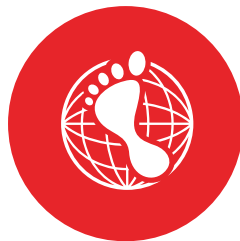
Climate: Ecosystem-Based Adaptation