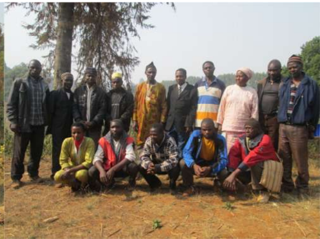
PARTICIPANTS DURING THE ELECTIONS