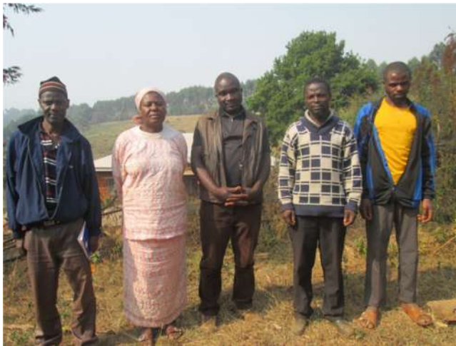
BOARD OF DIRECTORS AT BHKOV