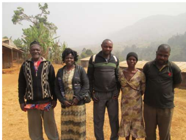
BOARD OF DIRECTORS AT MUTTEFF