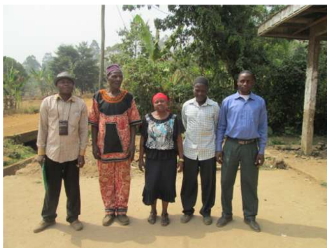
BOARD OF DIRECTORS ELECTED