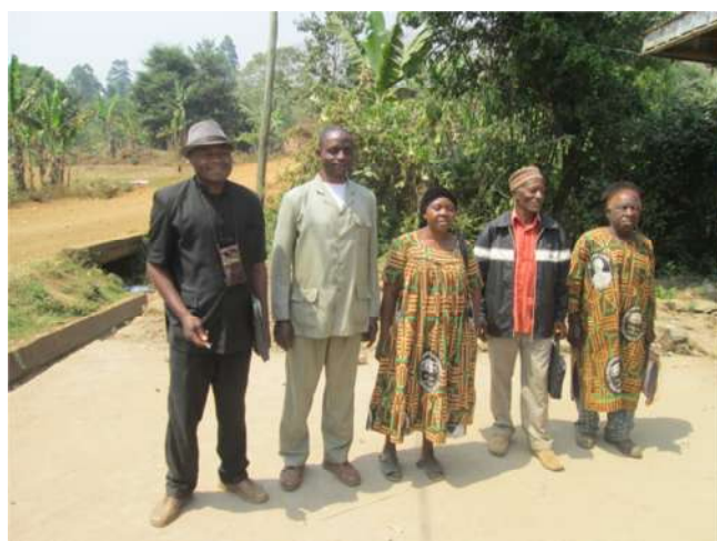
Delegates elected at MULION