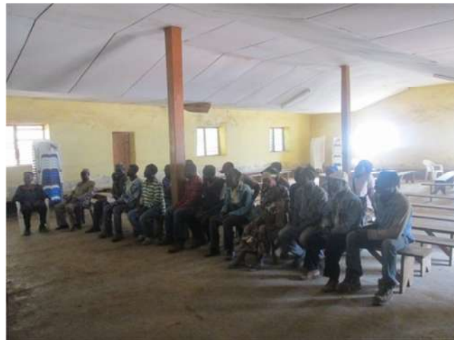
participants during the elections