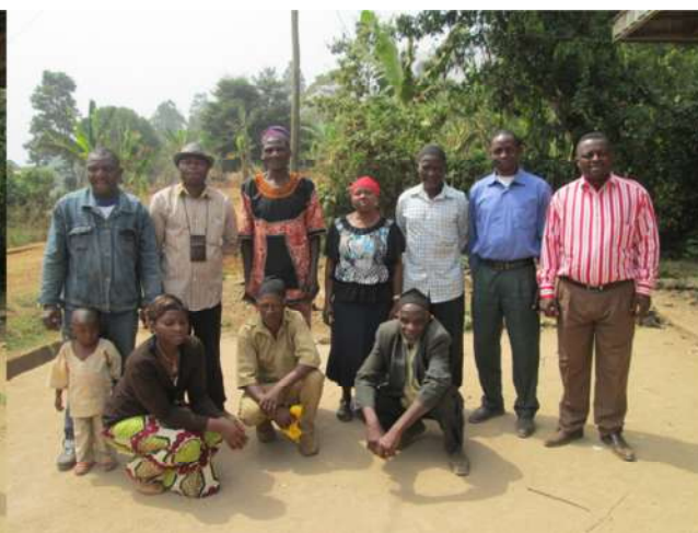
PARTICIPANTS DURING THE ELECTIONS