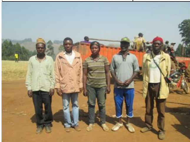
Delegates at AFUA