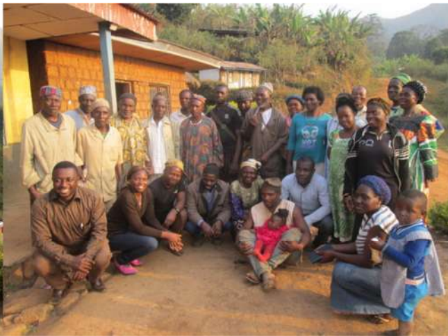
Participants at Aboh