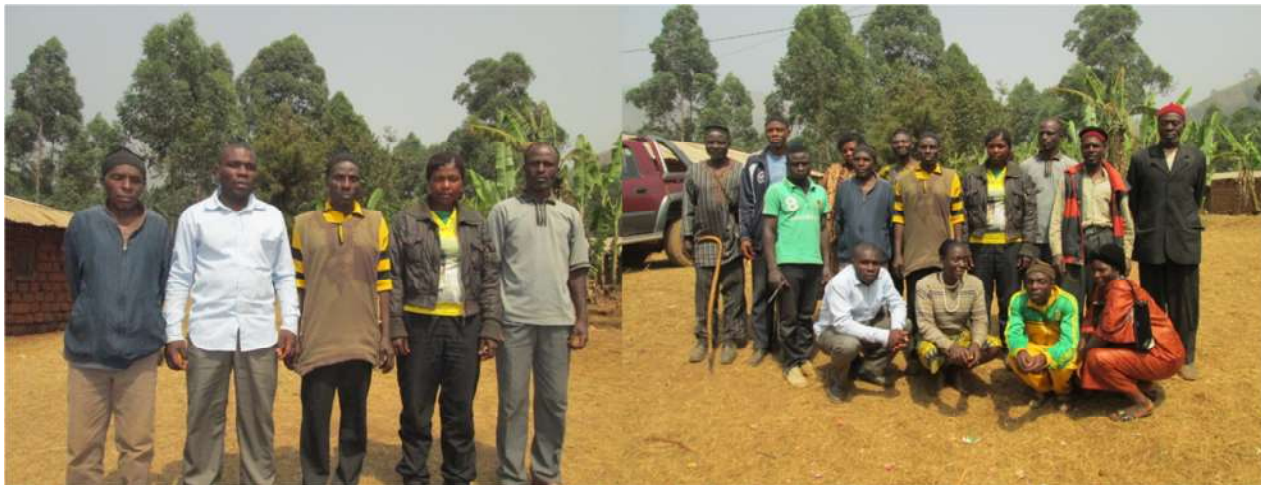
BOARD OF DIRECTORS ELECTED AT TUMUKU