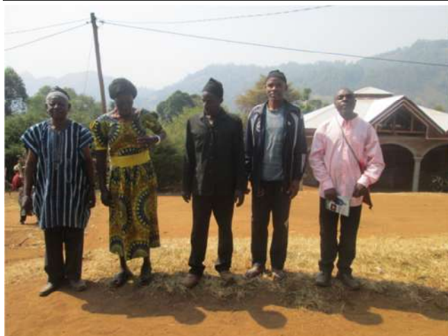
DELEGATES AT SOWI