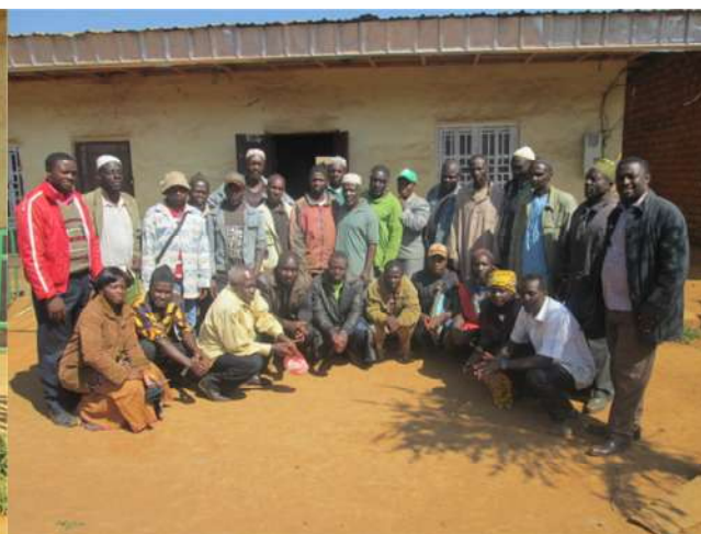
participants during the elections