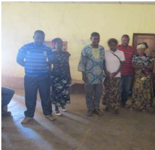
Delegates elected at MUTTEFF