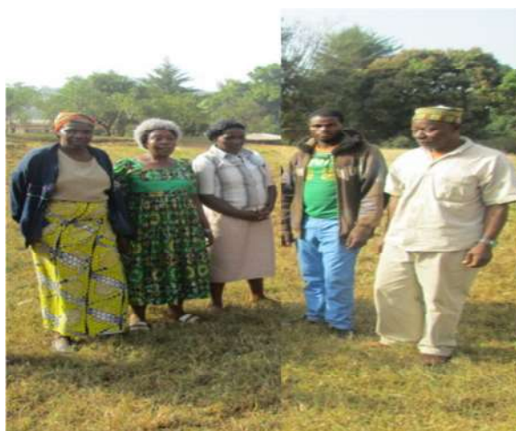
DELEGATES AT AKEH