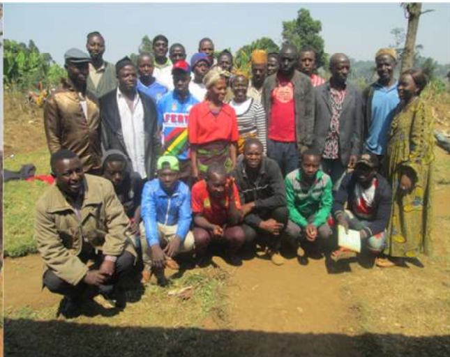
PARTICIPANTS DURING THE ELECTIONS