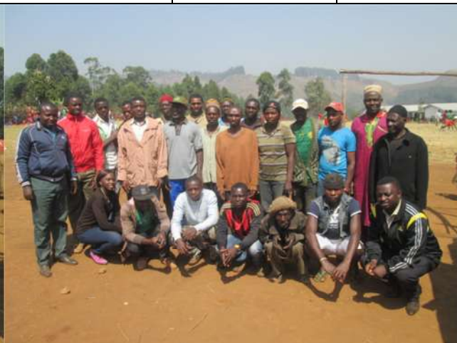
participants during the elections