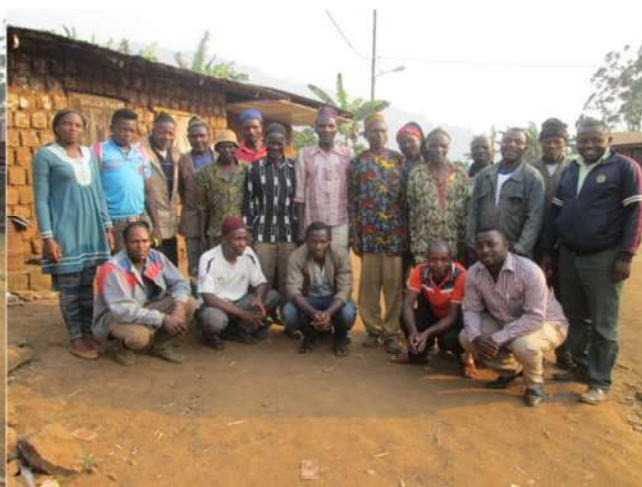
participants during the elections