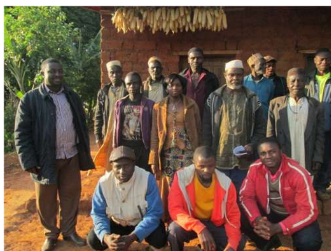
participants during the elections