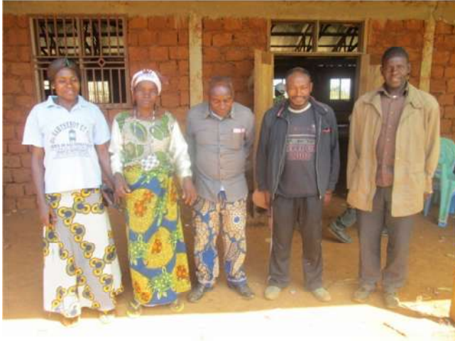
DELEGATES AT AJUNG