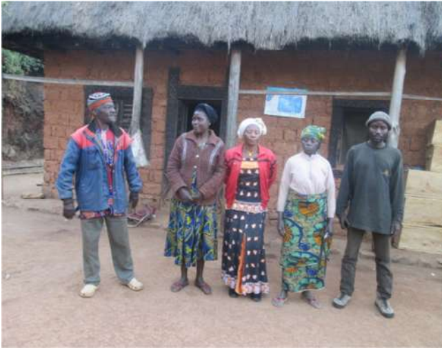
DELEGATES AT LIAKOM