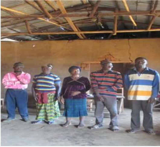
Delegates at MVEM