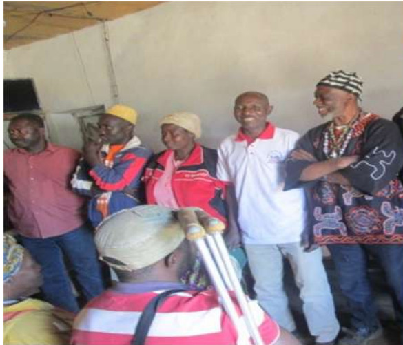
Delegates at MBESSA