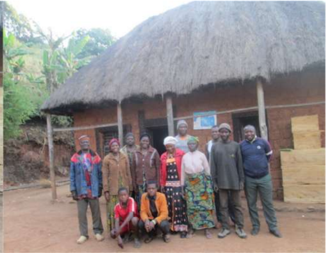
PARTICIPANTS DURING THE ELECTIONS