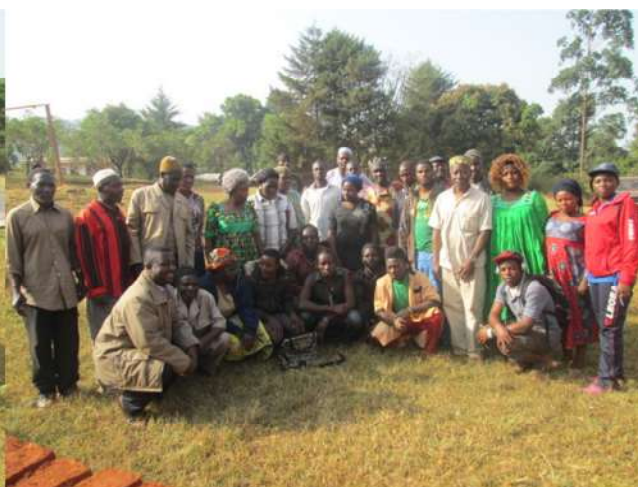
PARTICIPANTS DURING THE ELECTIONS