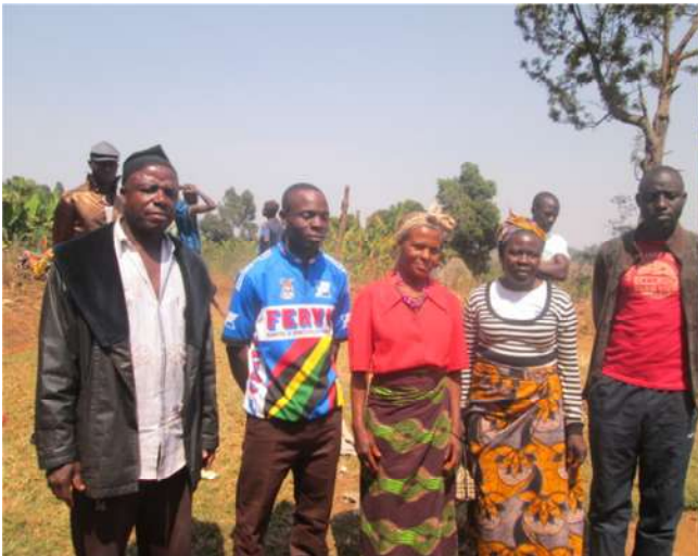
DELEGATES AT MBOH