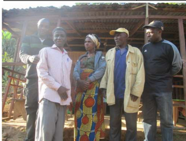
Delegates at ABUH