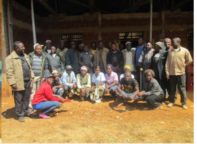
PARTICIPANTS DURING THE ELECTONS AT AJUNG