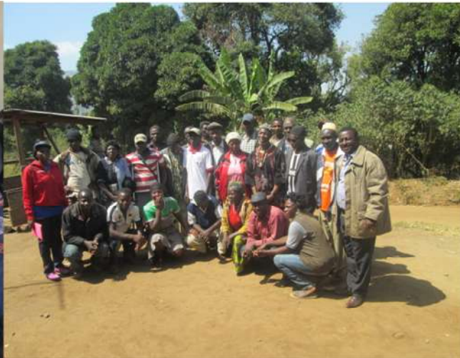
participants during the elections