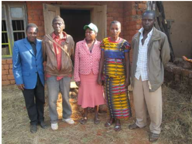
DELEGATES AT KAI