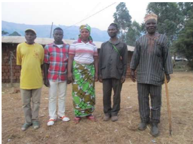
DELEGATES AT TUMUKU