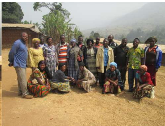
PARTICIPANT DURING THE ELECTIONS