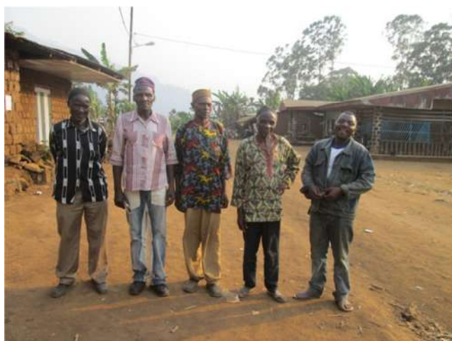
Delegates elected at YANG-