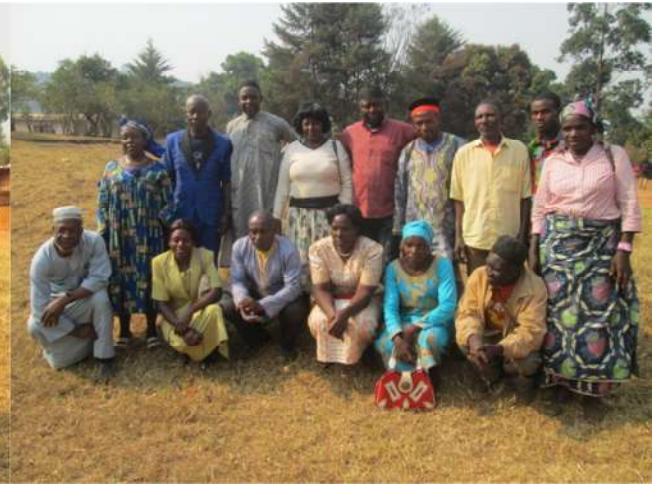
PARTICIPANTS DURING THE ELECTIONS