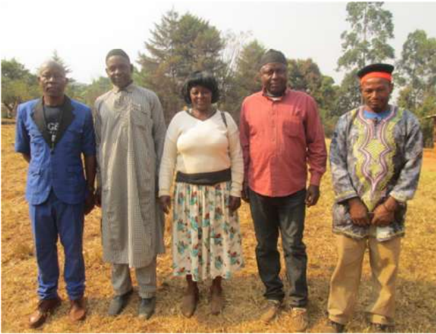
BOARD OF DIRECTORS AT AKEH