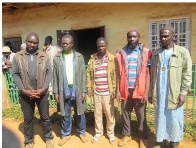
Delegates elected at VEKOVI