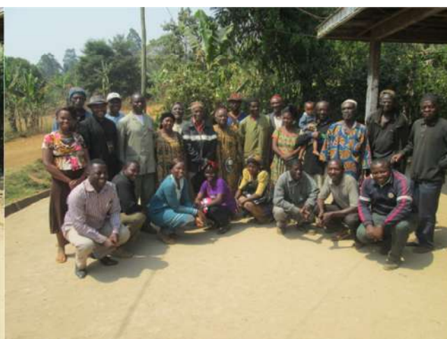
participants during the elections