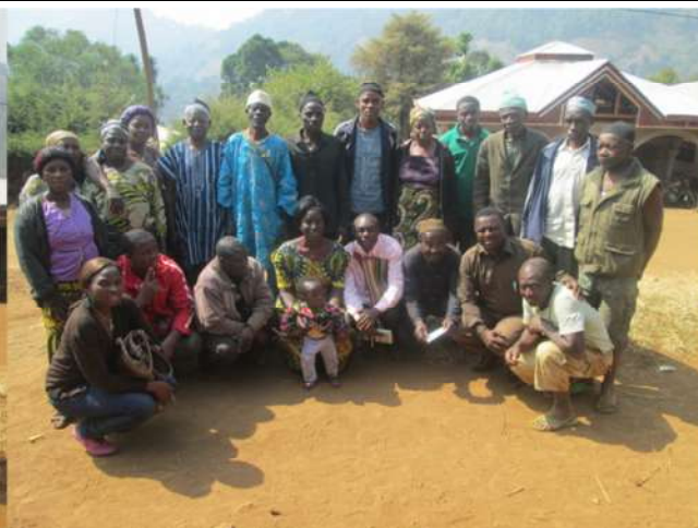
PARTICIPANTS DURING THE ELECTIONS