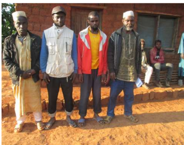
Delegates at NTUR