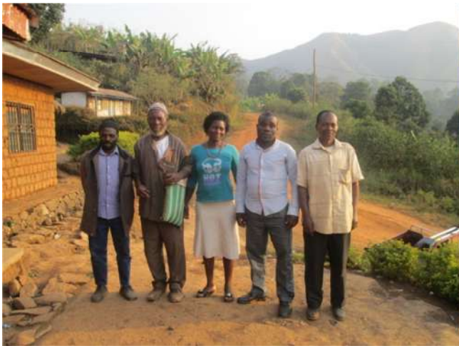
Delegates at Aboh