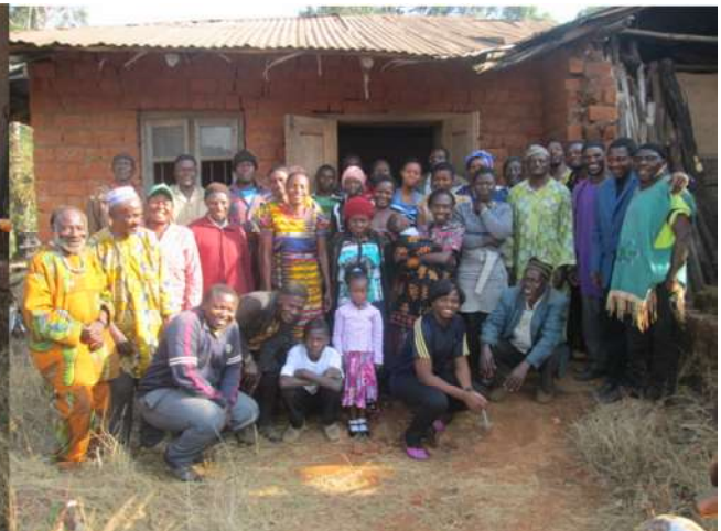
PARTICIPANTS DURING THE ELECTIONS