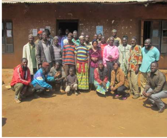
participants during the elections