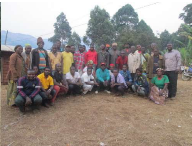
PARTICIPANTS DURING THE ELECTIONS