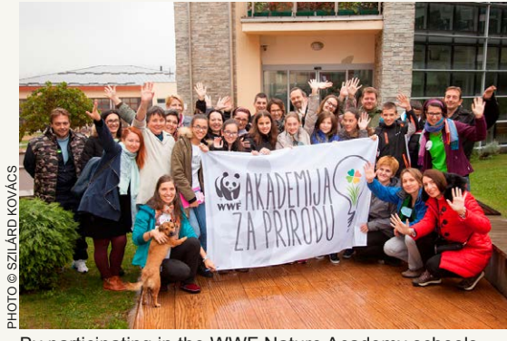
By participating in the WWF Nature Academy schools become ambassadors of protected areas and their natural treasure, and students and teachers become our allies in nature conservation.