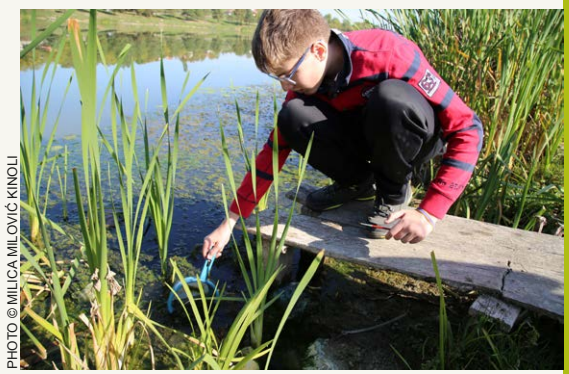
Surveys show that children spent less than one hour per day playing outside.

"If we don't understand why nature protection matters, it's hard to assume our kids will care about it. This is the main reason why I've applied for the WWF Nature Academy – I want to learn, to act, and to encourage my students"