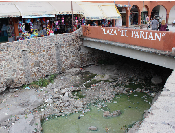
Drying out of a river in San Miguel de Allende

A technical advisor to the project is on site in each of the three pilot regions. The advisors coordinate ADAPTUR's activities and support local stakeholders in technical matters.