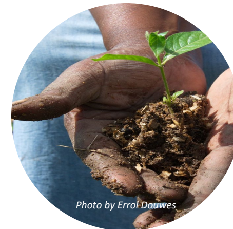
Boosting Resilience with Buffelsdraai Reforestation: Durban, SA