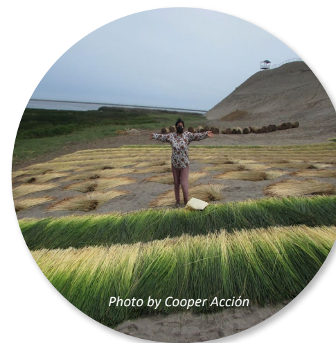
Sustainably Nurturing Native Landscapes in Tomas, Peru