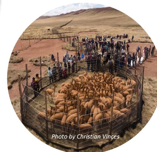
Lima's Coastal Wetlands: Women Powering Conservation through Art & Tradition