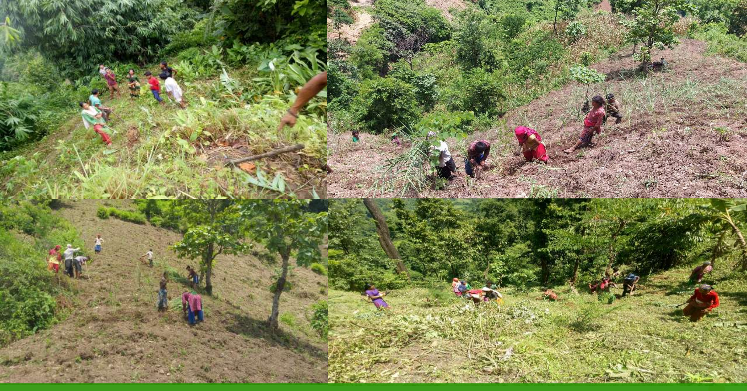
Plantation of broom grass on landslide prone cliffs