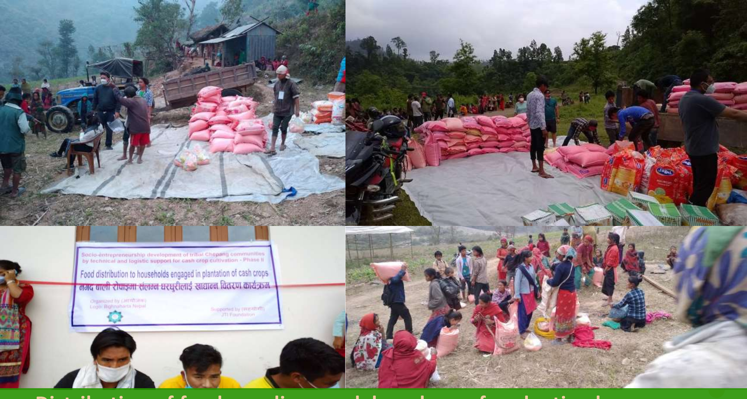
Distribution of food supplies as a labor charge for planting broom grass