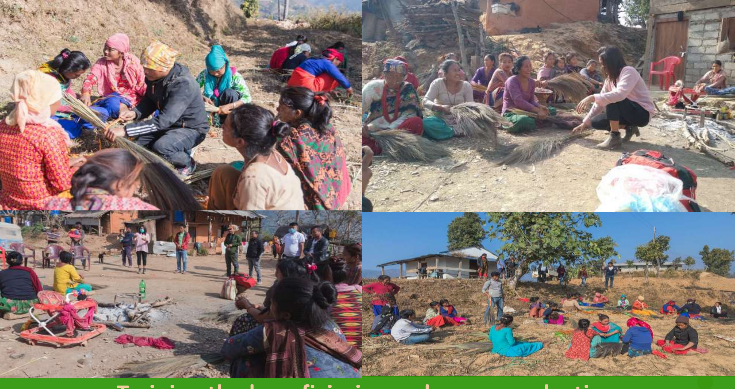
Training the beneficiaries on broom production